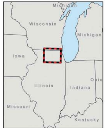
Map Region Shown